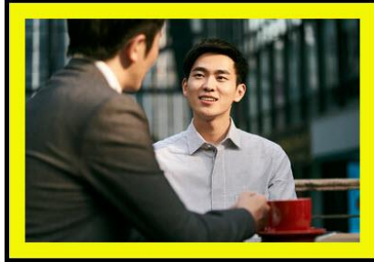
"AN INTERVIEW WITH THE DOCTRINES OF GRACE"