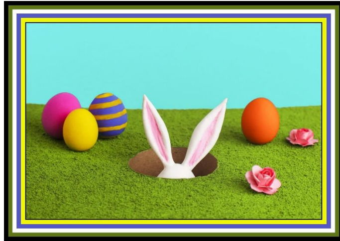
IS IT EASTER or PASSOVER?" Acts 12:3-4

QUESTION: is it Easter or Passover? ( Acts 12:3-4 )