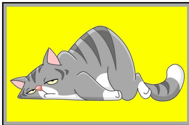
#12 “THE ‘ORIGINALS’ ” “Those weak in faith”

Dear Reader, the answers to all questions about this life are contained in The Book of Life called The King James Bible .